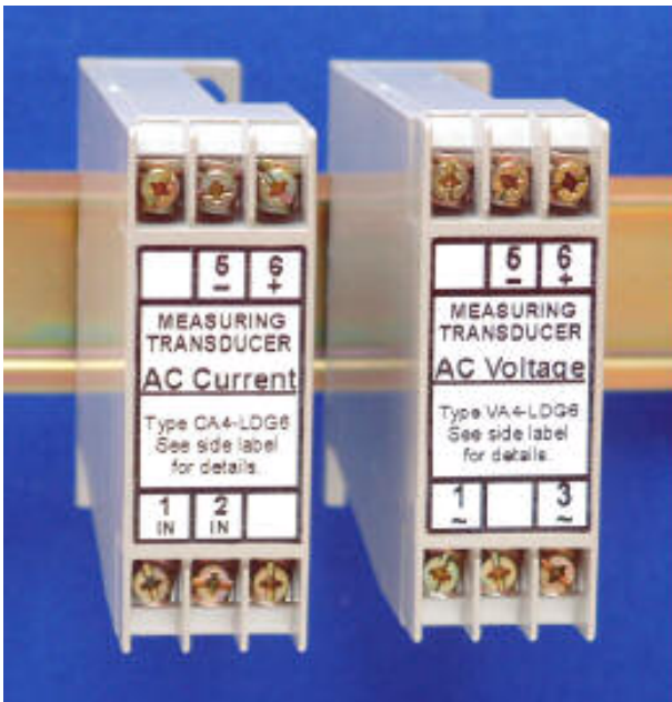
Figure 1 – LDG6 Enclosure

The transducer converts an AC current into a load independent DC current or voltage signal, which may be used to drive a number of remotely installed instruments.